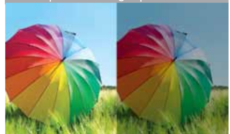
Optically bonded Corning® Gorilla® Glass